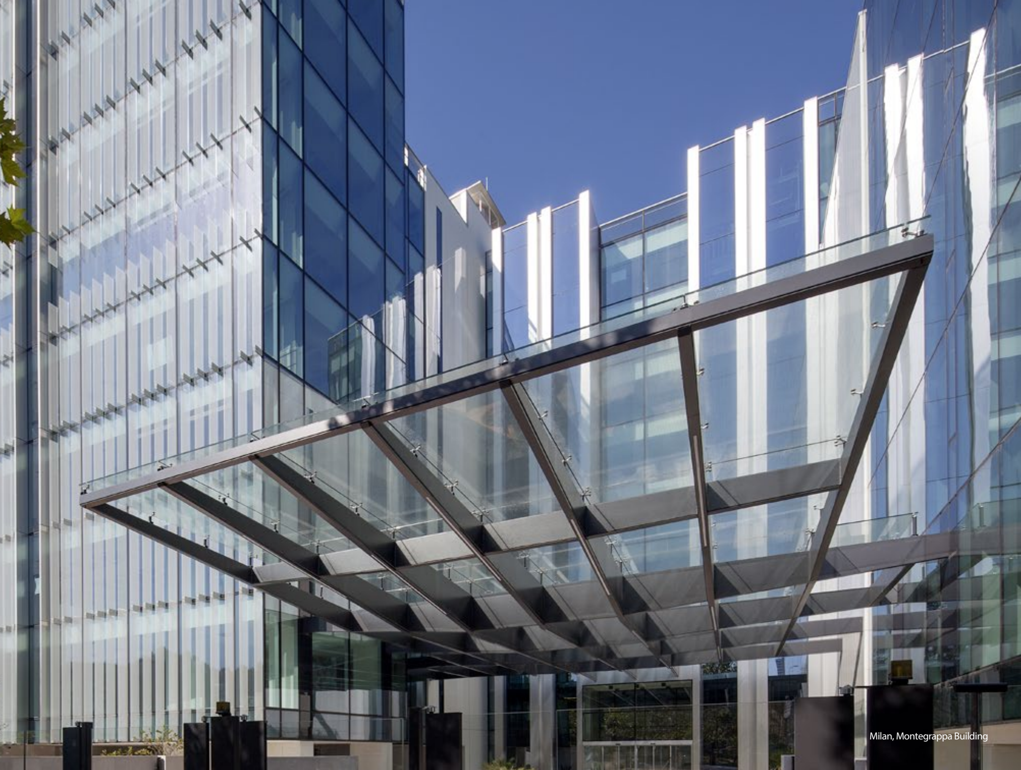
Milan, Montegrappa Building